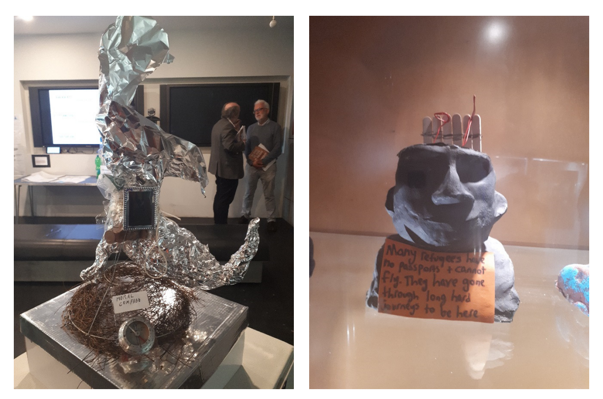
Figure 1 – Sample Artefacts from the Exhibition 'We Make The Road by Walking'

(2018) document some of the journey that six UCC based student teachers took as they grappled with their research areas in becoming critical researchers in multicultural and DE.